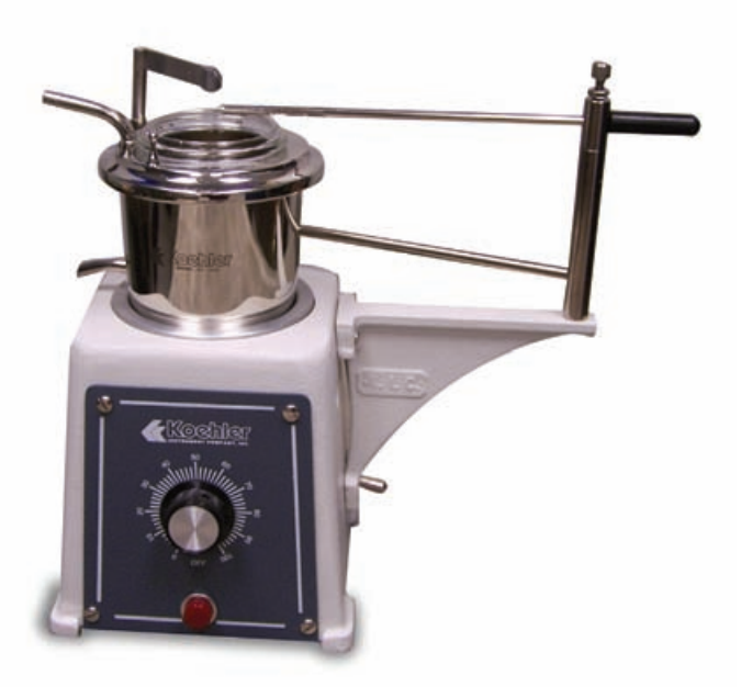
K15600 Tag Open-Cup Flash Tester

For NIST traceable certified thermometers, please refer to the ASTM Thermometer section on pages 184 through 191.