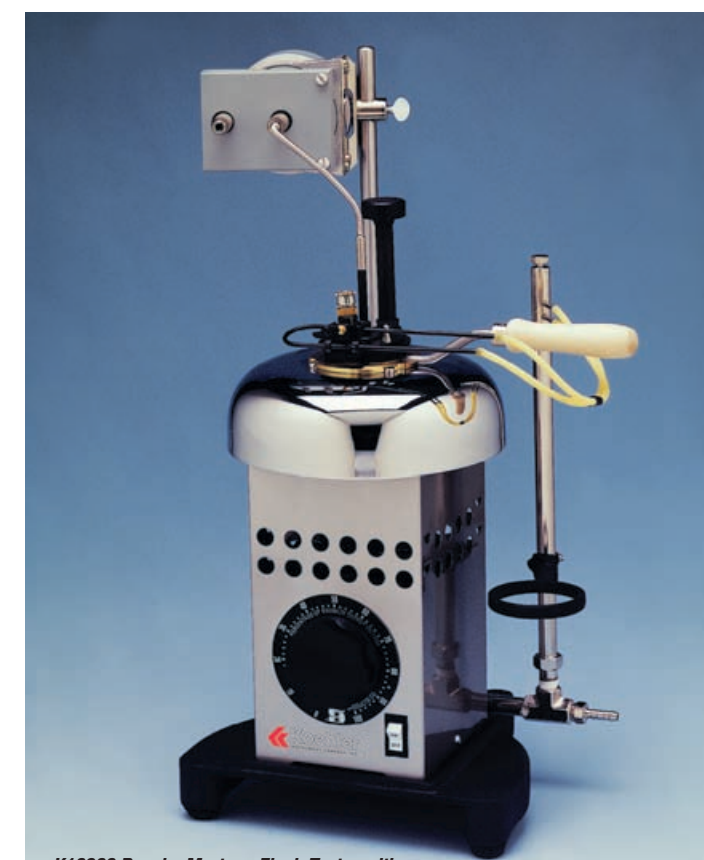
K16200 Pensky-Martens Flash Tester with K16220 Accessory Stirrer Motor (Sold Separately)