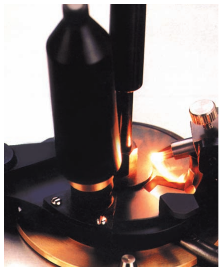
Automated Tag closed Cup Flash Point Tester

Dimensions lxwxh,in.(cm) 21 x10.5x19.75 (53.5x26x50) Net Weight: 44 lbs (20kg)